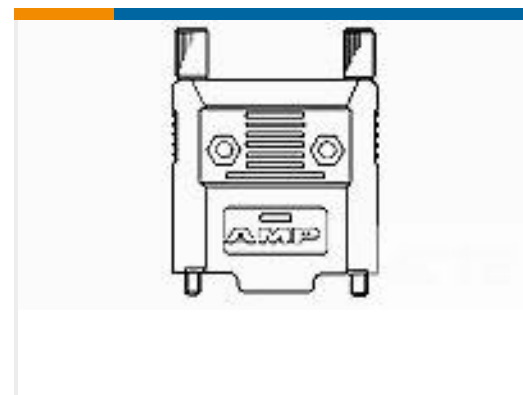
TE Part # 174469-3 CABLE CLAMP KIT 9P AMPLIMITE