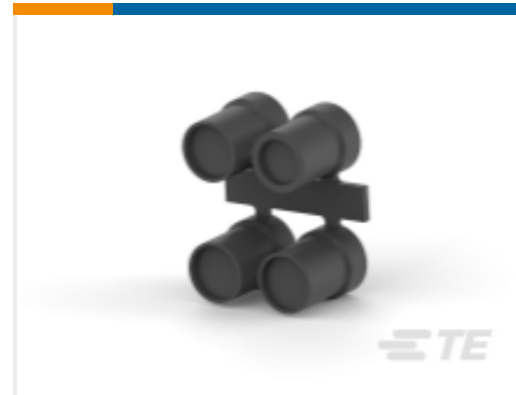
TE Part # 747746-1 GROMMET ASSORT-SZ1/2 CBL CLMPS