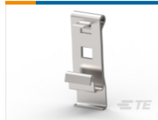
TE Part # 745255-2 SPRING LATCH 2/BAG